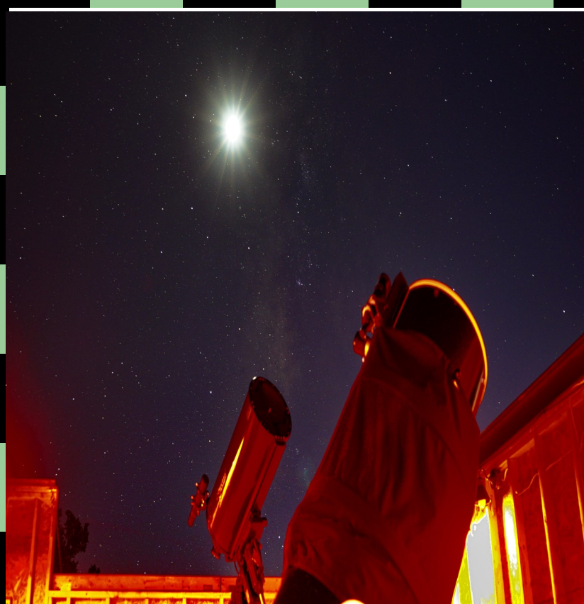
as well as portable telescopes to take advantage of the dark skies at UBarU creating a unique camp experience. Kids will have opportunities to swim and play. Meals, housing, supervision and instruction are included in the cost. $275 per attendee until June 30 ($300 following). For more detailed information about the camp, see www.ubaru.org & to register.